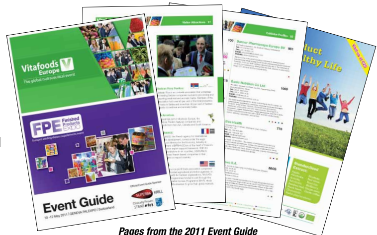
Pages from the 2011 Event Guide

The 2011 events combined attracted the largest audience yet of 10,350 attendees from 92 countries meeting more than 500 suppliers.